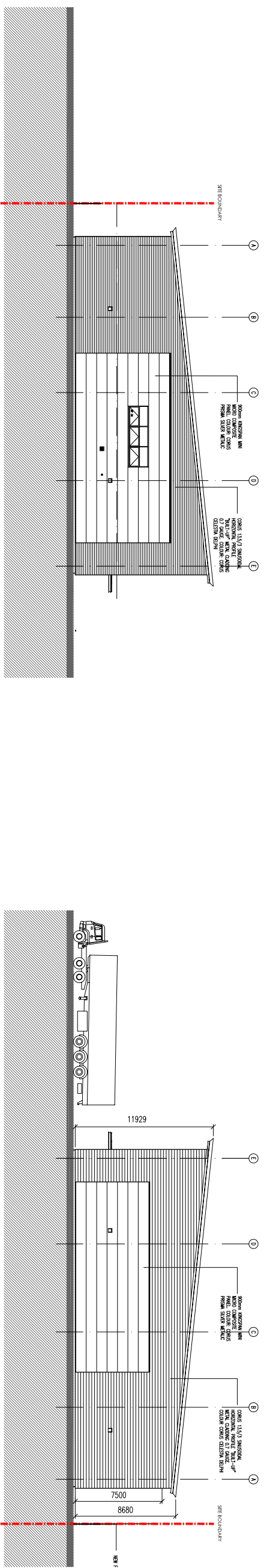
EAST ELEVATION ALONG G.L. 1